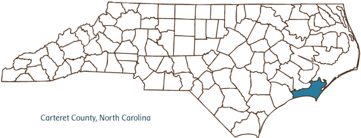
Carteret County, North Carolina